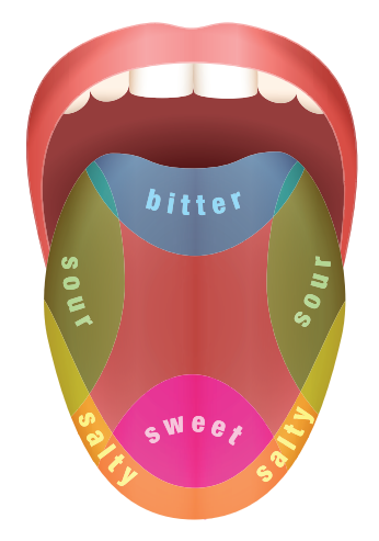
Figure 1: Bitter Tastebuds Are On Back Of Tongue

Yes! That's on purpose. The bitter taste stimulates the taste buds on your tongue which then stimulates a cascade of biochemical reactions that cause the neuroendocrine cells in the gut to release CCK (aka cholecystokinin – a gut hormone) which activates your liver and gallbladder and helps make this a more powerful detox. The herbs will still work if you sweeten the formulas with stevia, but we have seen when people taste the bitter taste in their mouth, it is a more powerful cleanse. Make sure to add water to your dose of bitter herbs – this really helps a lot. We have a saying in herbal medicine, "The bitterer the better." If you really object to the taste – it's ok – no one's judging you – just add the stevia. You can also add some nondairy milk or coconut milk powder.