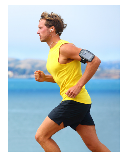
Run Farther, Train Longer