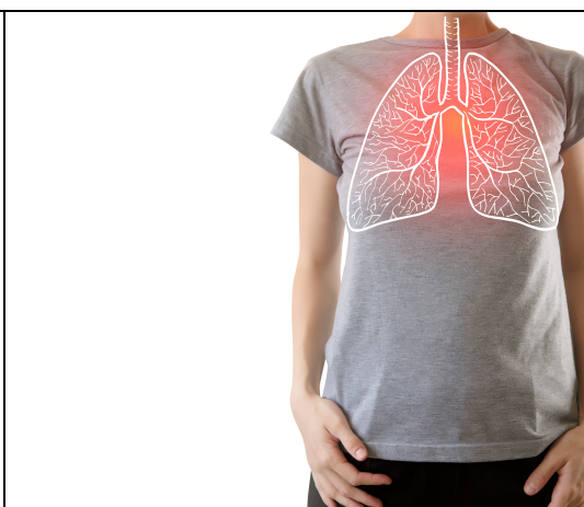
Lungs – front of body – can also apply on back of body in same location