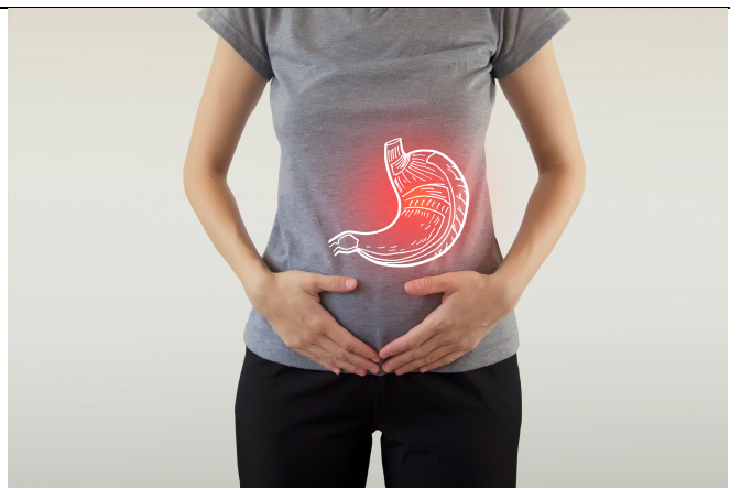
Stomach area – front of body