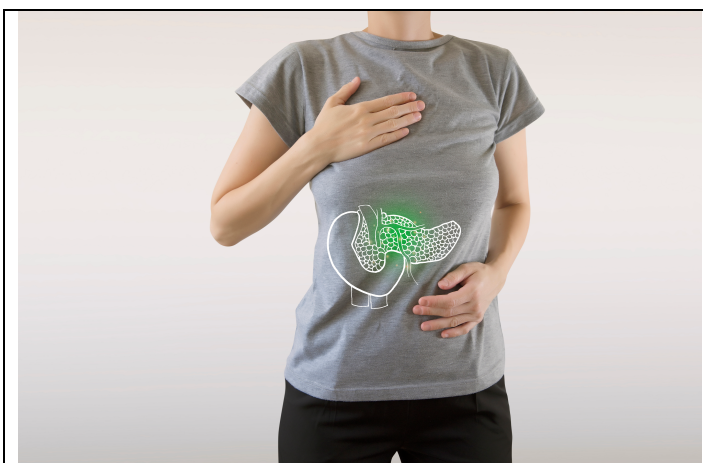
Pancreas – front of body